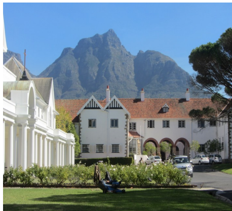
Bishop's College, the venue of the ISASA School Library Conference held in April 2013.